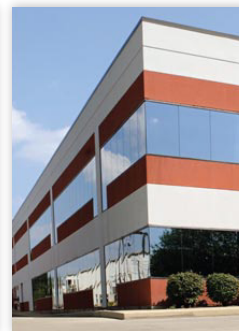
Commercial & Multi-Tenant Facilities